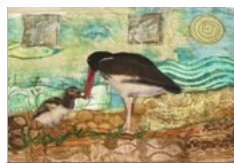
Gelli printing on fabric