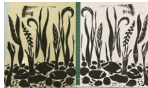
From plate to print